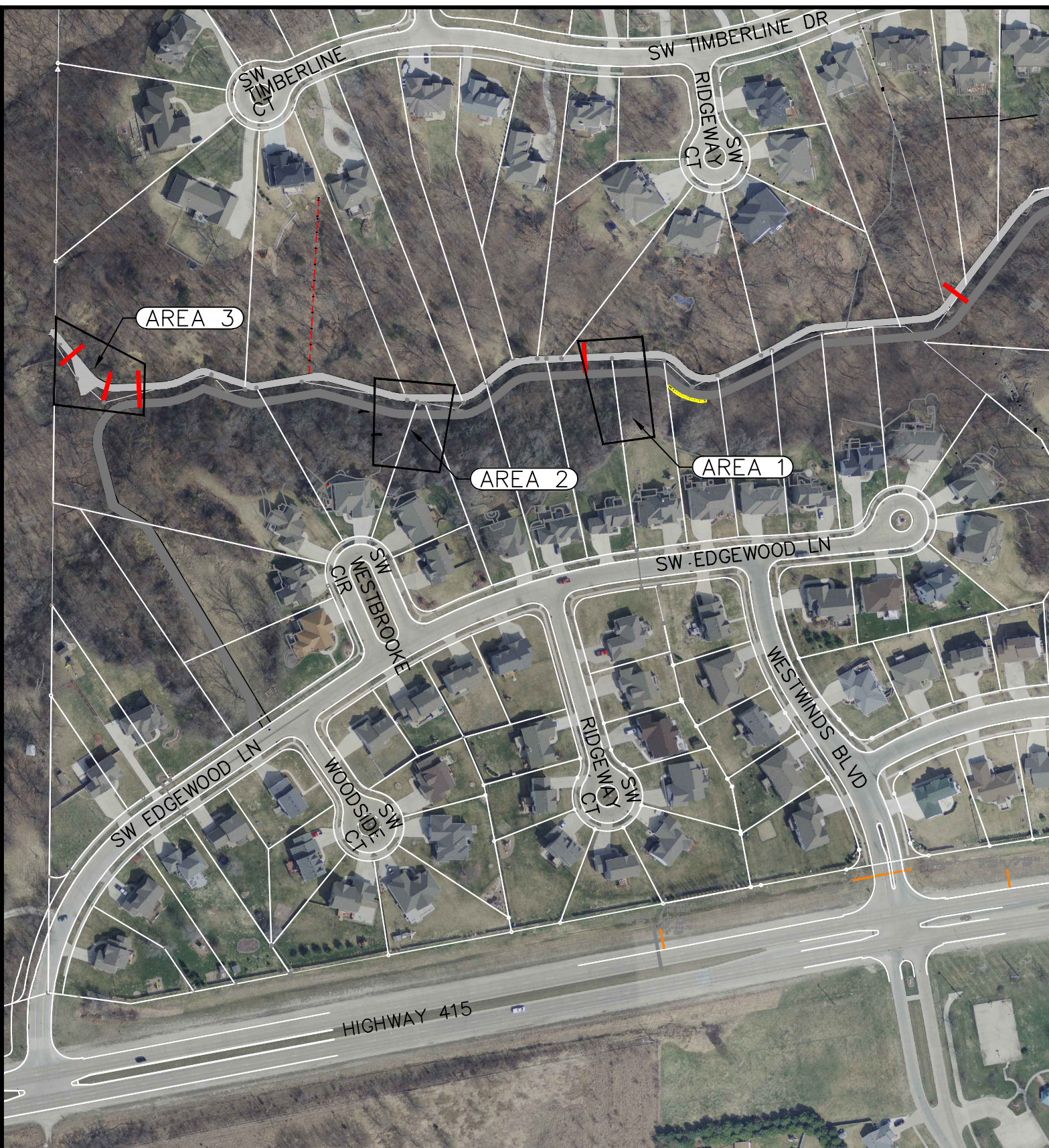
Westwinds Erosion Repairs and Channel Stabilization Exhibit C: Project Location Map