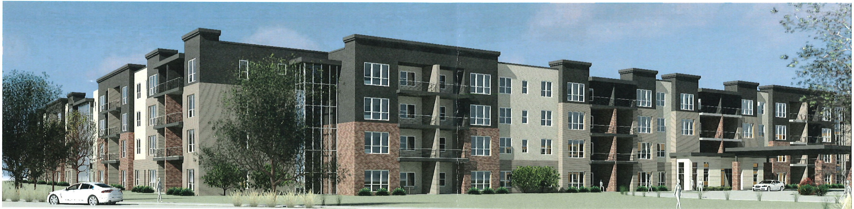
① 3D View 12' = 1'-0"