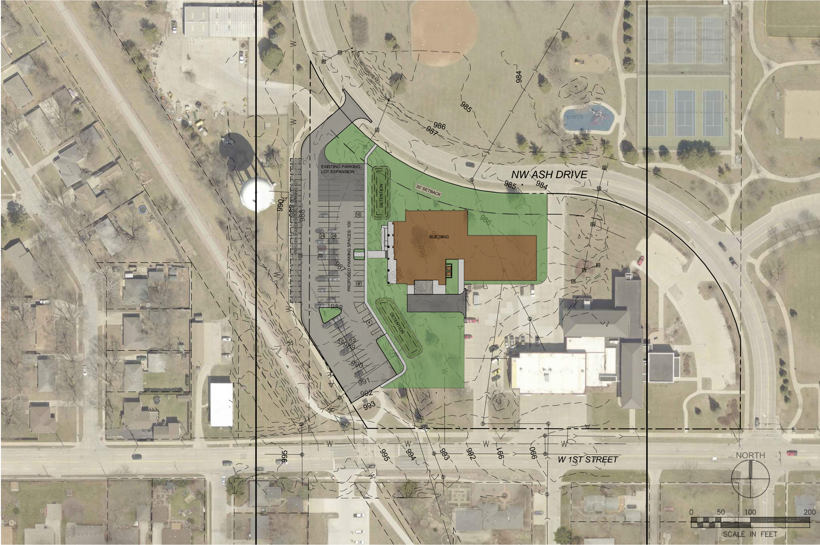
EXHIBIT-A, SITE PLAN