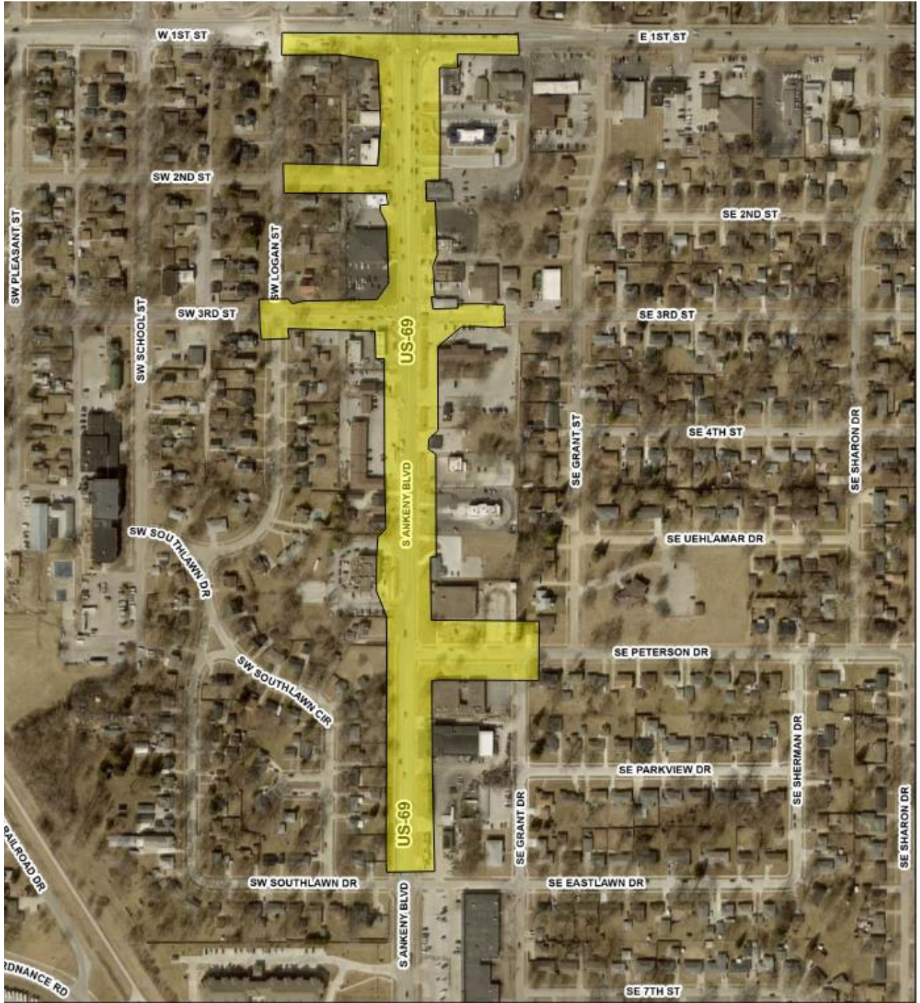
Exhibit D Project Location Map